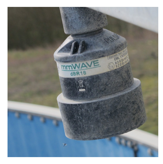
dBR16 on a foamy aeration tank.

Where the surface of the substance being measured is hot, it can create a temperature gradient above the surface. This will affect the speed of sound and creates an inconsistent ultrasonic signal, which effectively will reduce the accuracy of the measurement.