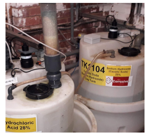
dBR8's reading through the plastic lid of a chemical tank.

Radar measurement will produce more stable results than ultrasonic sensors with limited acoustic power on foamy applications. This is because the foam interrupts the signal of the ultrasonic transducer; you can still get around this issue with ultrasonic measurement by using a sensor with high acoustic power. However, one thing that both technologies have in common is that it is virtually impossible for them to see through the foam to the liquid surface.